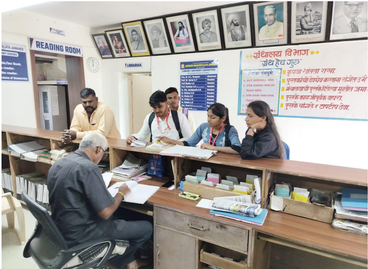
Book borrowing section