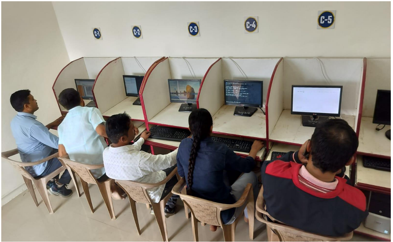
e- resource and network Centre