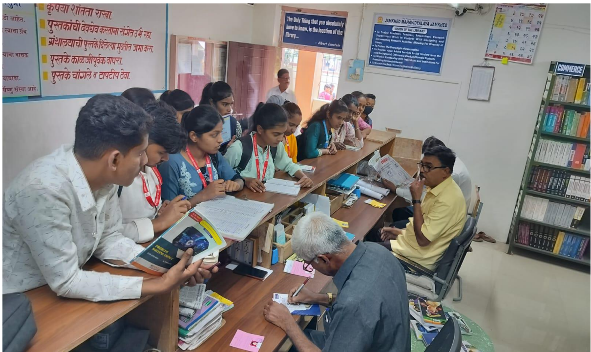
Book borrowing section