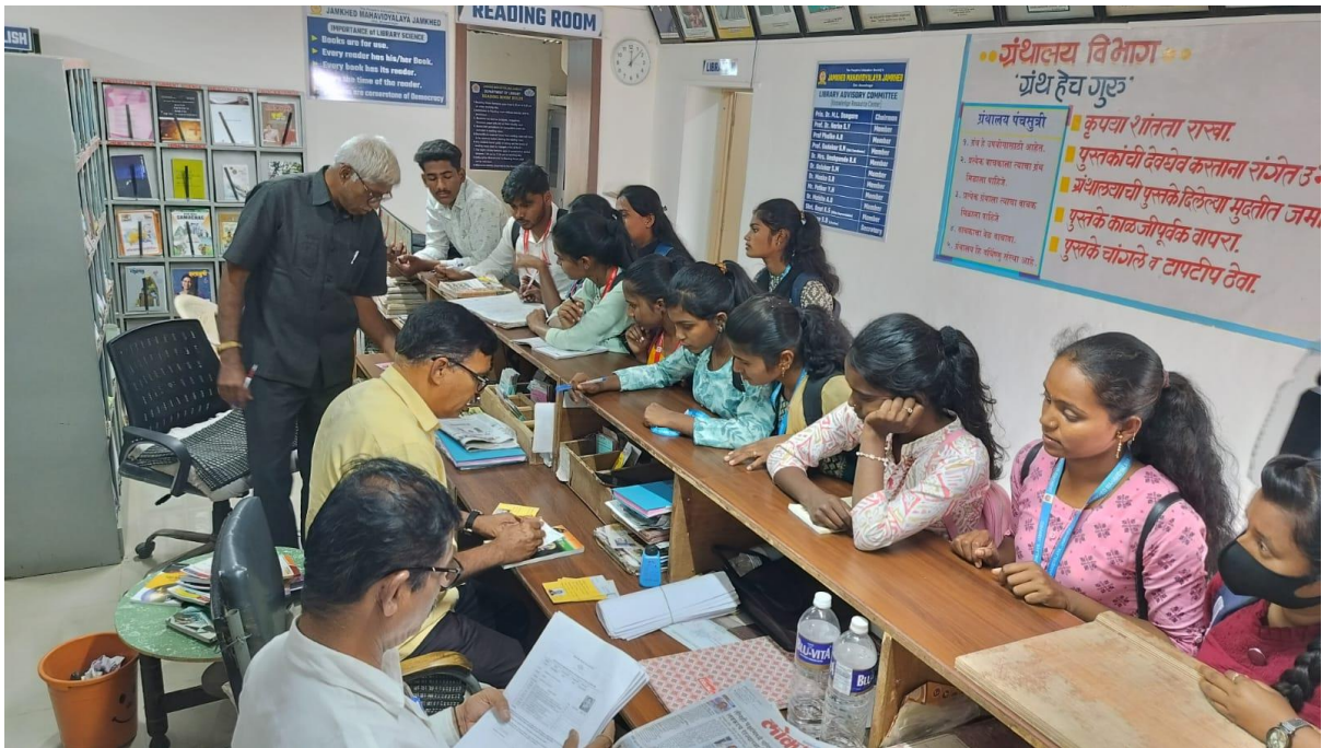
Book borrowing section