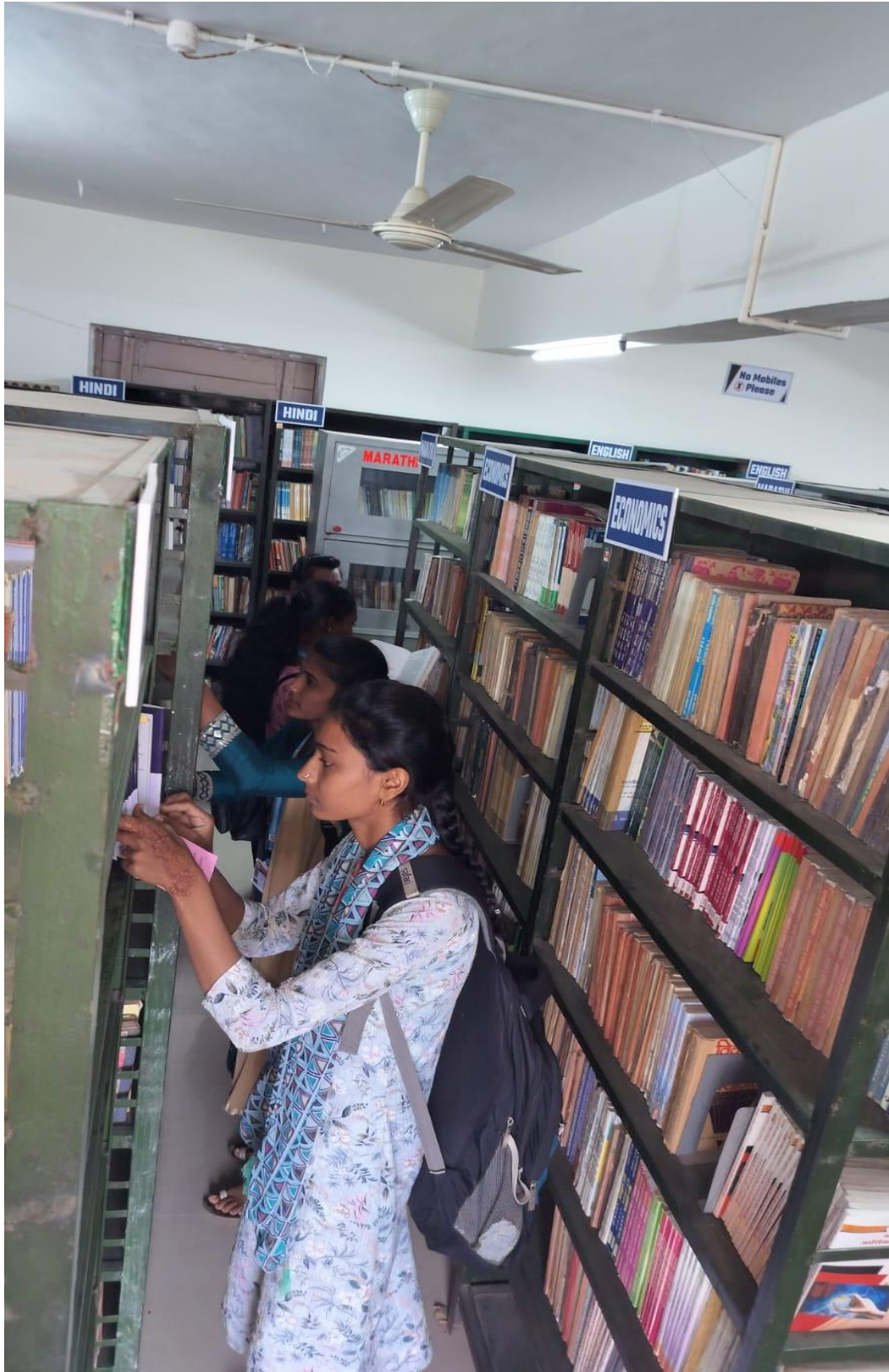
Book stack Section