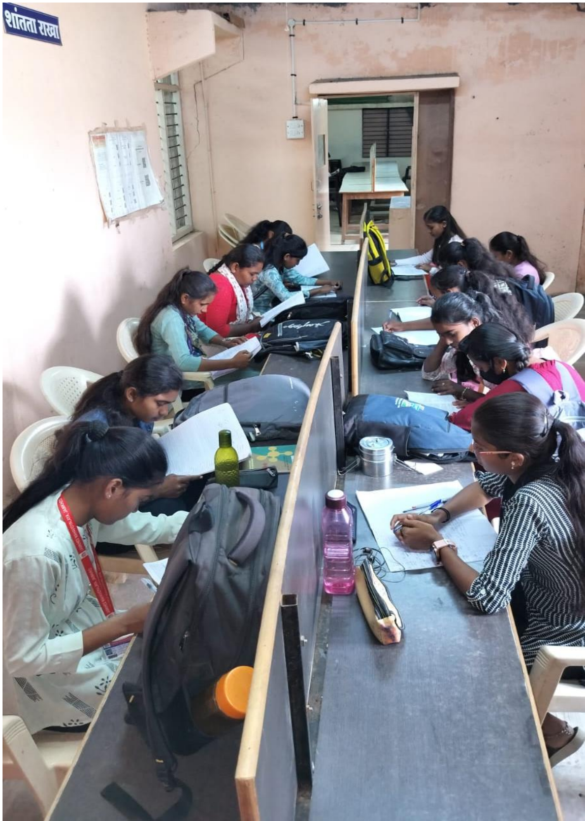
Reading Room Section